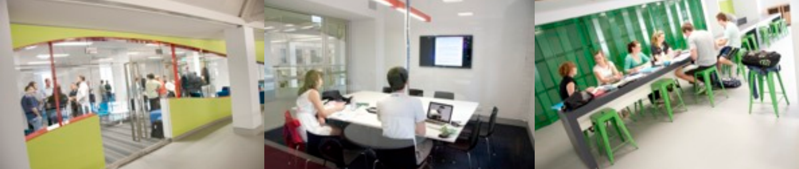
The Staff & Student Commons in use