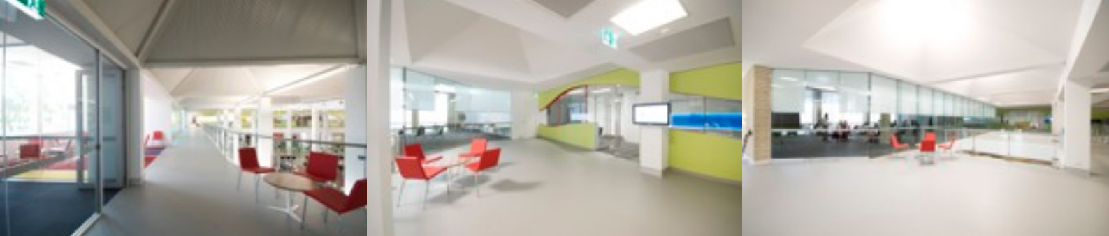
Staff and Student Commons refurbishment