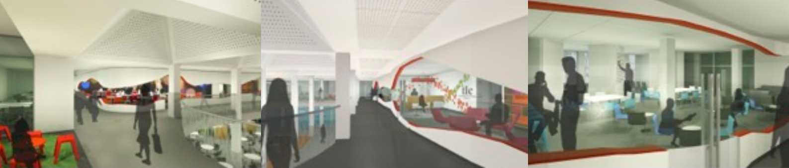
The Staff & Student Commons visualizations